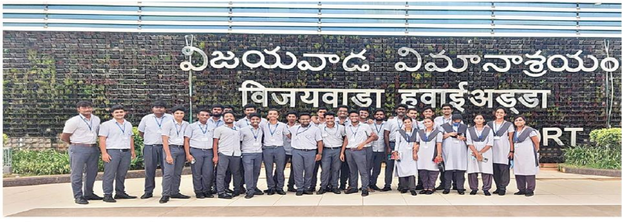
Andhra Loyola College final year BBA-Aviation students