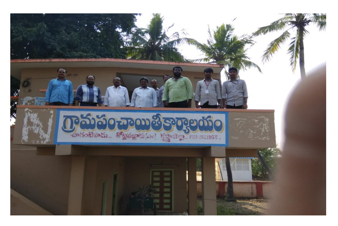
Day8 9<sup>th</sup> Jan 2019: Energy and Trunk infra - Power, Ports etc

The Andhra Pradesh govt. setting up the second major port in Dugarajapatnam and also 600 kw solar power plant in Visakhapatnam. The Visakhapatnam port taking up green energy initiatives.