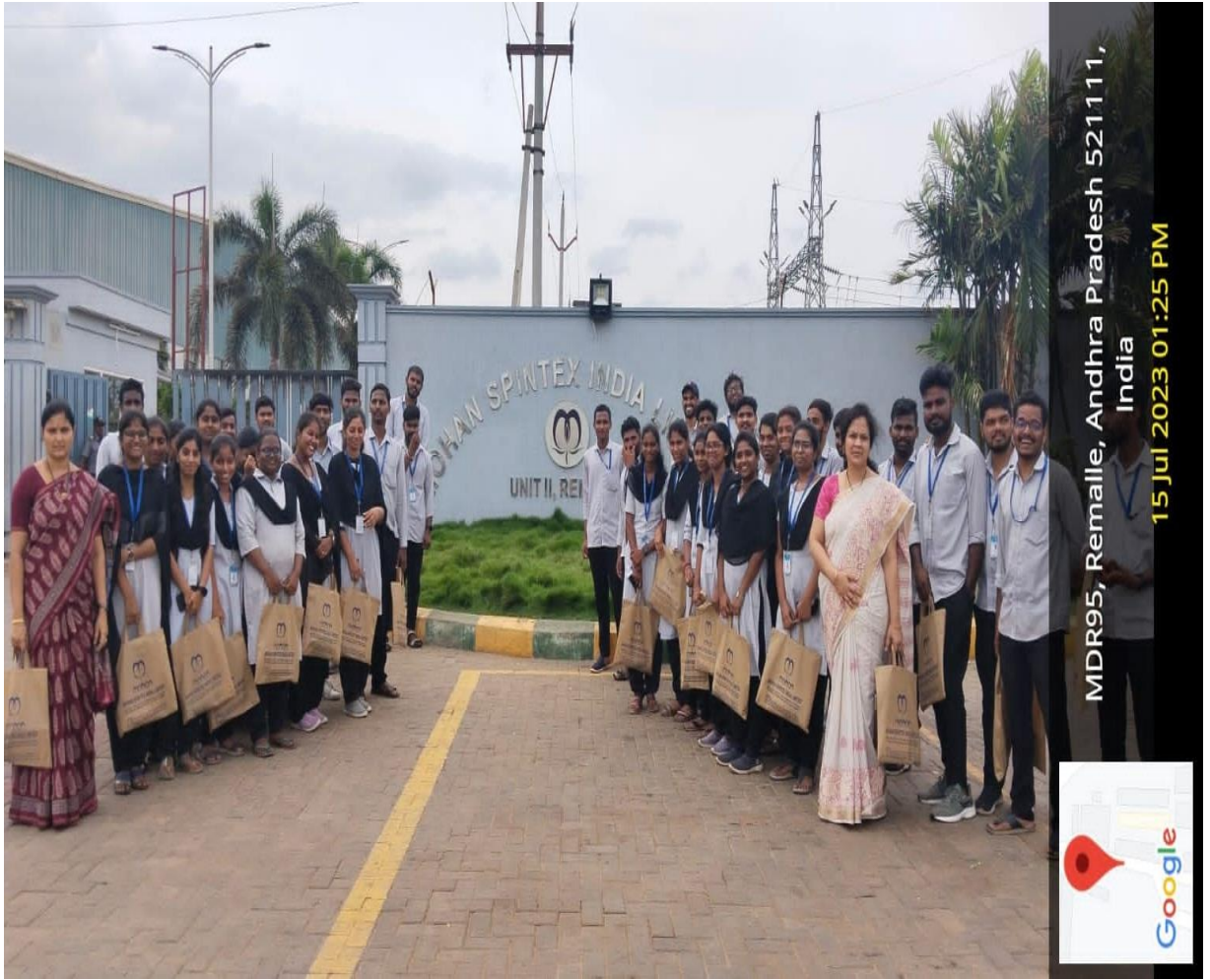
MBA STAFF AND STUDNETS AT MOHAN SPINTEX INDIA LIMITED