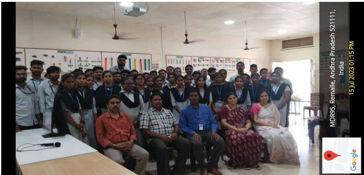
MBA STAFF AND STUDNETS WITH MOHAN SPINTEX INDIA LIMITED OFFICIALS